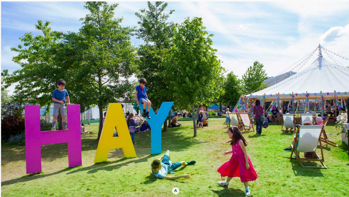
Soak up the literary vibes at the Hay Festival © Elisabeth Broekaert.

On the Isle of Anglesey you'll want to check out The Marram Grass . Yes, this is quite literally a shed of a restaurant, but it serves up food inspired by the surrounding land – and many of the ingredients are grown in the garden. For something a little special, opt for the Cegin tasting menu where you'll get to taste a range of the eatery's classic dishes and drinks.