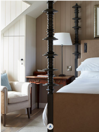
Get away from it all at The Grove, Narbeth © Phil Booman.

Known as the land of mountains and valleys, there is no shortage of impressive hikes to be had either in the Brecon Beacons National Park, or around the famous peak of Mount Snowdon. Looking for thrills? Head to Zip World , where you can ride the fastest zip wire in the world above a disused slate quarry, weave your way through the forest on a Alpine toboggan coaster, or bounce as high as you can through a cavern the size of a cathedral.