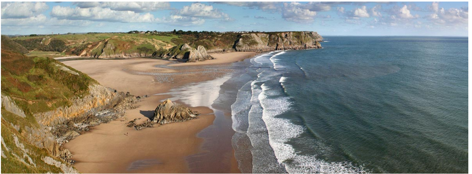
Take a stroll (and your camera) along the breathtaking Gower Peninsula coastline © Getty Images.