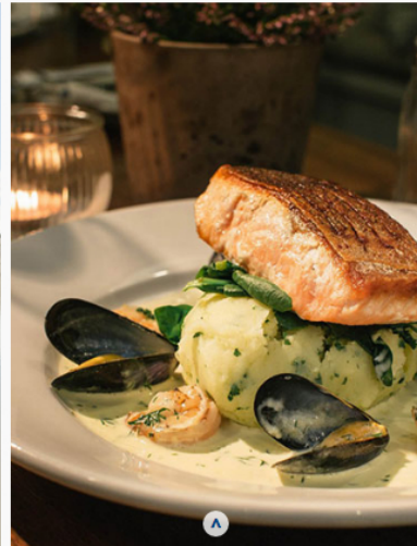
Feast on locally-sourced seafood at one of Tenby's tempting eateries.