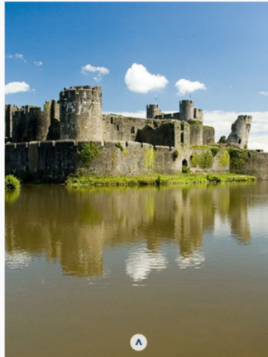
Explore the imposing towers of Caerphilly Castle © Getty Images.