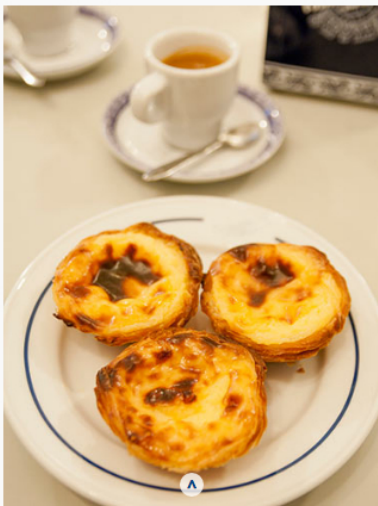
Pastel de nata (or Belem), a Portuguese sweet treat of flaky pastry filled with a creamy egg custard

Pastel de nata – the flaky pastry cases filled with creamy egg custard. We recommend sticking with tradition on this occasion, so head to Lisbon's Pasteis de Belem – where the recipe is said to have originated.