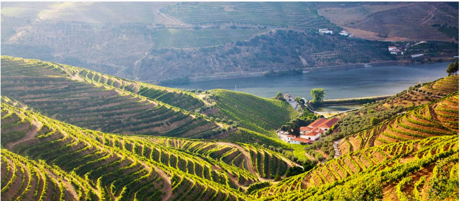
Portugal's majestic Duoro Valley is home to verdant vineyards and the city of Porto