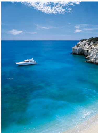
Algarve's Vila Vita Parc has swoon-worthy views of the Atlantic Ocean