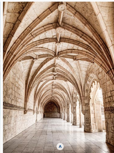
Lisbon's Jerónimos Monastery is a great example of Portugal's Manueline architecture