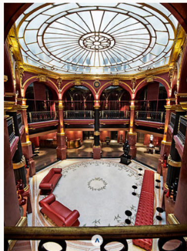
The grand lobby of Paris' Banke Hotel in the Opéra district