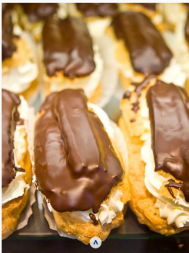
French fancies: don't miss sampling chocolate éclairs in Paris